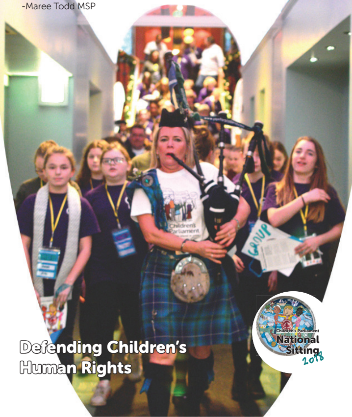
Defending Children's Human Rights